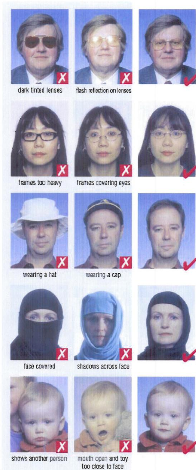
Figure 11 (45 images) – Best practices for the purpose of travel document creation.