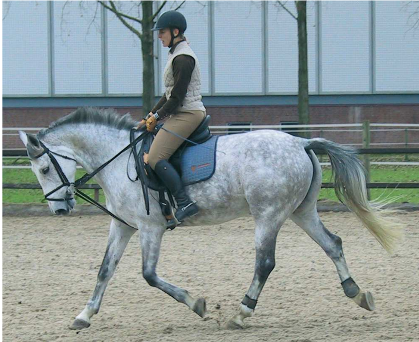
Figure 3. A horse ridden “rollkür” (round and deep with a draw rein) in the study of Sloet van Oldruitenborgh-Oosterbaan et al. (2006)

shows that the treatment resembled a posture in which the horses were ridden with the nose behind the vertical (comparable to HNP3 in Figure 2), but not with the chin onto the chest. Riders were not blind to the treatment and half of the horses started with a test in LDR, the other half of the horses in a test with a natural posture (comparable to HNP1 in Figure 2), with only light rein contact. During the tests horses were trotted and cantered for several minutes.