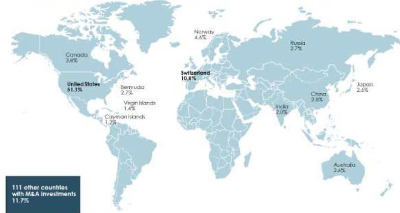
Figure 2.4 Origin of M&As towards EU Member States

Note: The period covers 2003-2016. Data were extracted in August 2017 and include confirmed transactions (number of M&As). The distribution is made on the number of investments, meaning that large transactions matter the same as other projects in this figure.