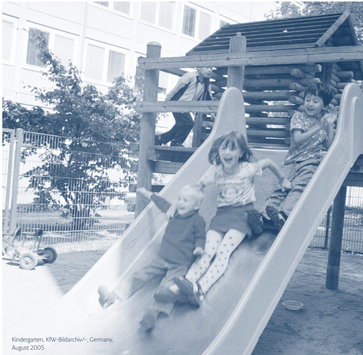
Kindergarten, KfW-Bildarchiv/-, Germany, August 2005