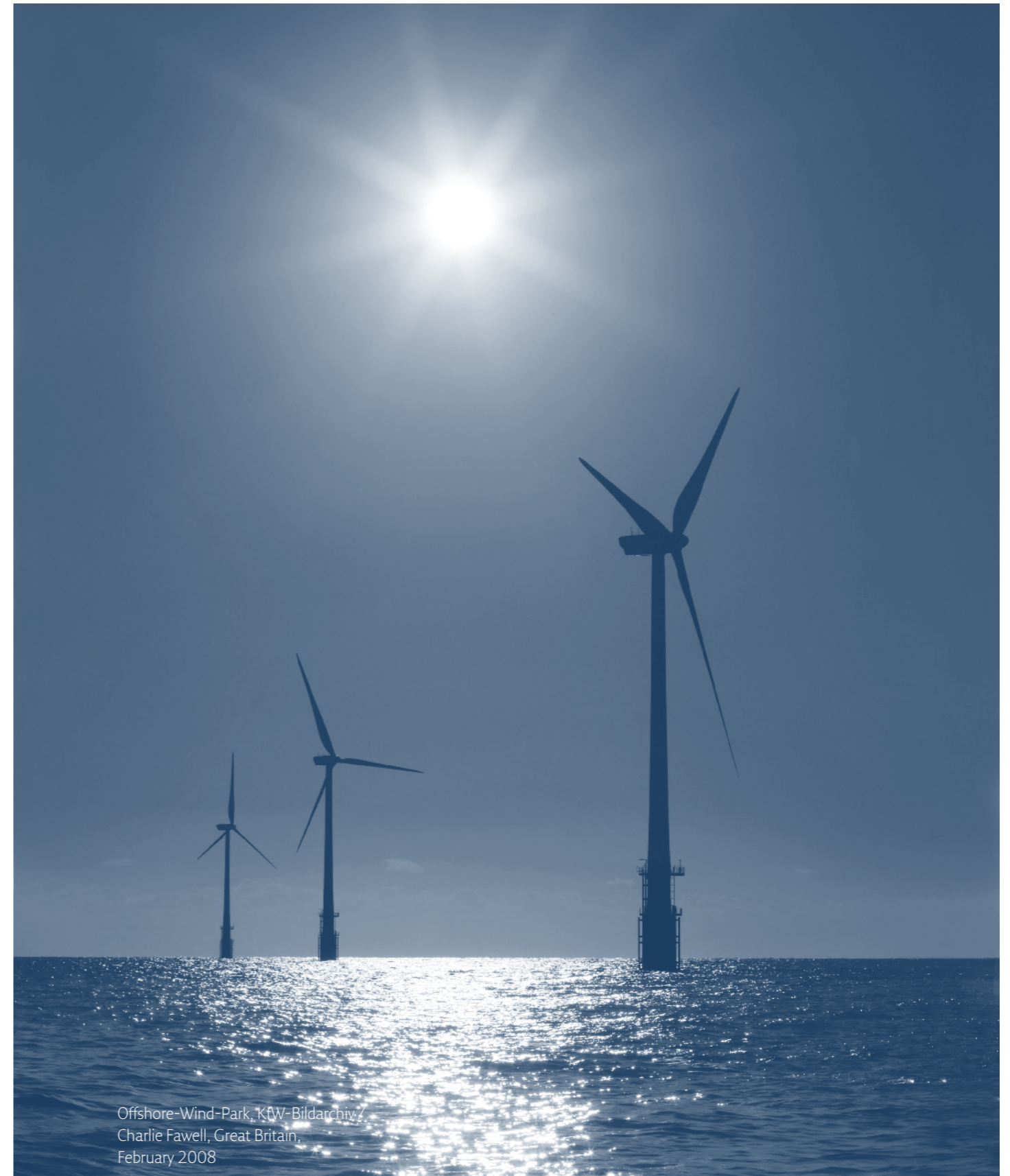
Offshore-Wind-Park, Great Britain, February 2008

Europe already has a highly efficient and secure payment infrastructure. Digital innovations and global trends have moved the demand for retail instant payment services into focus. To avoid fragmentation of the payment market, pan-European solutions should be decisively supported. Instant payments as a new payment infrastructure within the Single Euro Payments Area (SEPA) can play a major role.