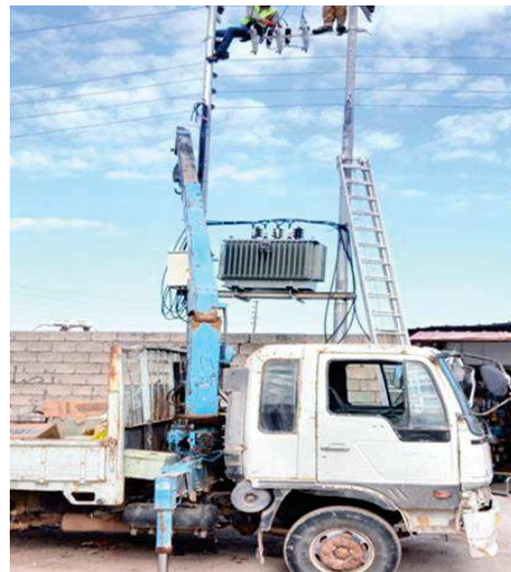
Transformers are installed and connected to the poles.