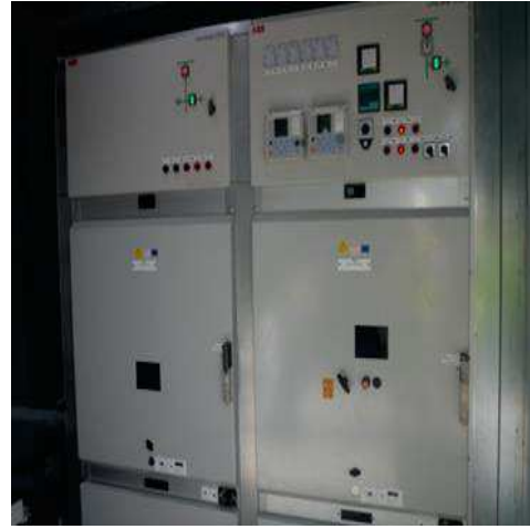
33Kva switch gear