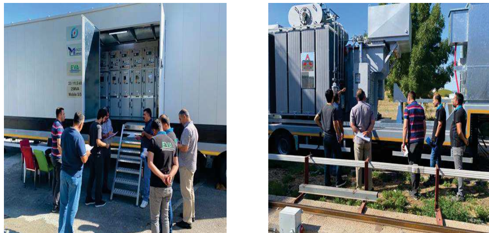
Visual inspections of the switchgear cabinet (left) and tap changer (right) were carried out.