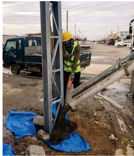
Excavation works for tubular poles are carried out (left) and lattice poles are installed (right).