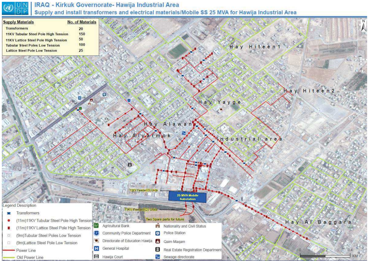
Map of final layout of electrical network in the Industrial zone