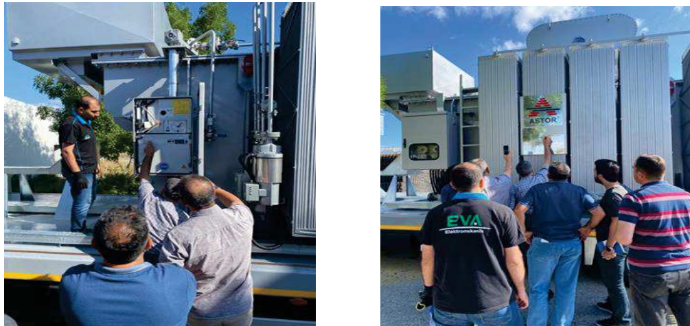
Engineers are testing the tap changer tests (left) and are verifying the specifications and name plate of the substation (right).