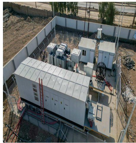
View showing the mobile substation in Hawija, installed.