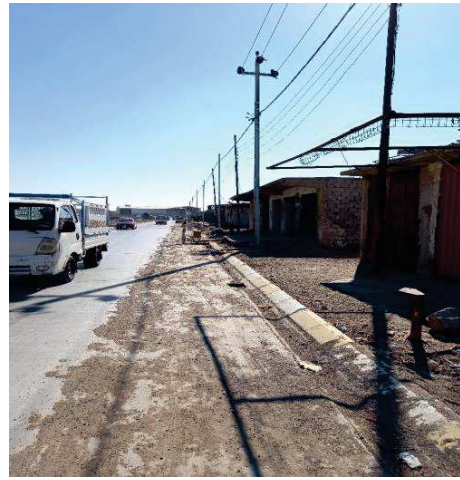
The fully rehabilitated electricity distribution network in Hawija.