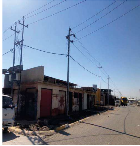
Parts of the electricity distribution network prior to rehabilitation and after the completion of works.