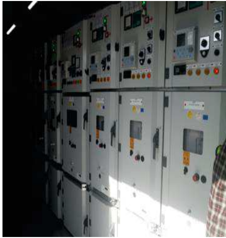
11Kva switch gear