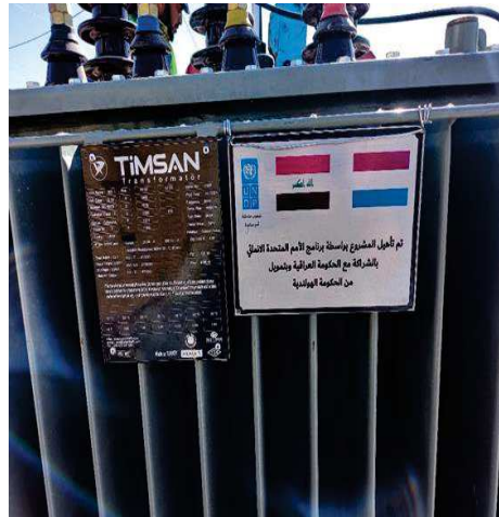
The electricity distribution network is operational (left). Transformers were fitted with donor branding (right).