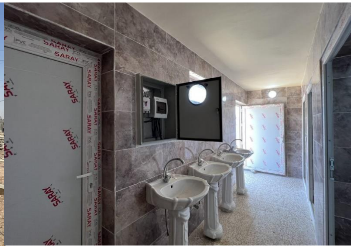
Pictures 2 and 3. The construction of latrines contributed to the improvement of the working conditions in the Industrial Zone.