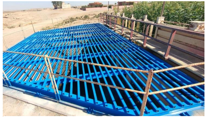
Picture 9. Finalized sluice gates on main irrigation canal in Hawija.