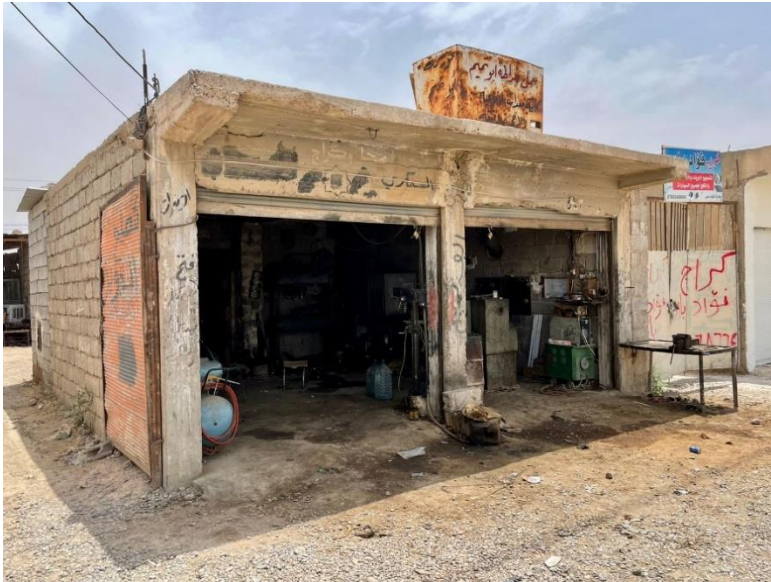
Picture 6. Shops in the Industrial Zone during the process of their rehabilitation.

IOM identified 259 shops with damages categorized in line with the Emergency Repairs of War-Damaged Shelter Guidelines to be rehabilitated. These guidelines ranked the magnitude of the damage in four categories: Category 1 are structures with limited damage to walls, doors, and windows. Category 2 are structures with extensive damage, but no structural damage. Category 3 are structures that had sustained significant structural damage and required extensive repairs and finally, Category 4 are