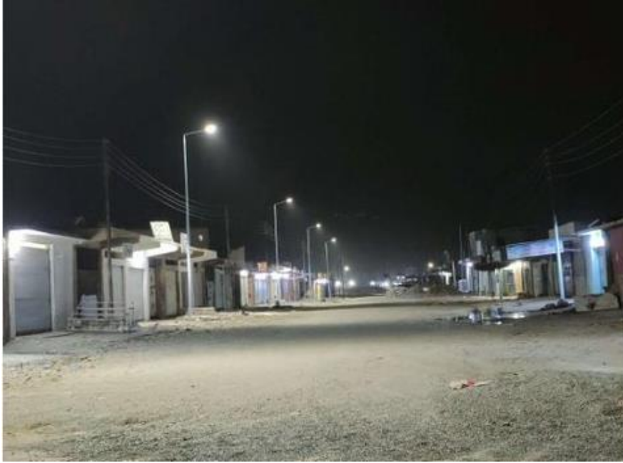
Picture 1. The installation of street lightings led to extended working hours within the Industrial Zone in Hawija and provided increased security.