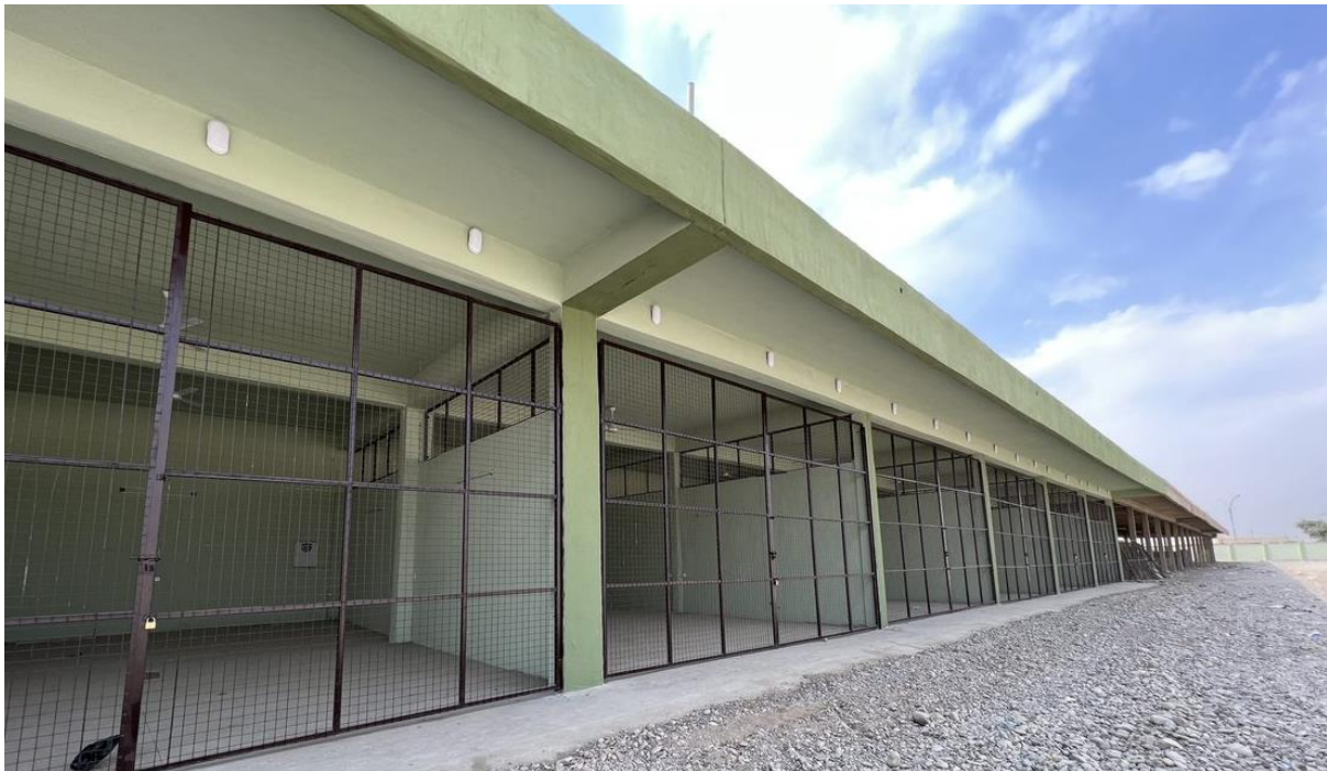
Picture 7. Rehabilitation of 20 shops for the vegetable market in Hawija.

Market and damage assessments conducted by IOM to gain a better understanding of the context and gaps of the Hawija agricultural sector showed that the majority of assessed sectors such as construction, automobile, and metal industries are largely male dominated while women constitute a large proportion of the workforce in the agricultural sector. Considering this, IOM conducted one dedicated FGD with women from the agricultural sector, seeking to promote women's representation