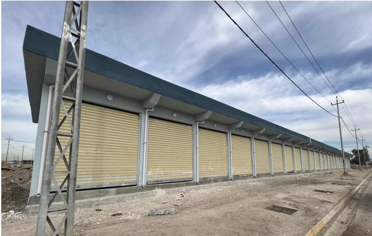
Picture 4. The construction of new shops led to an increased number of economic opportunities enhancing economic dynamics in the Industrial Zone.