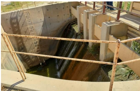
Picture 8. Picture of the sluice gate of the main irrigation canal of Hawija before IOM intervention.

During project implementation, IOM followed strict procurement guidelines, vetting contractors against the UN Security Council Consolidated List.