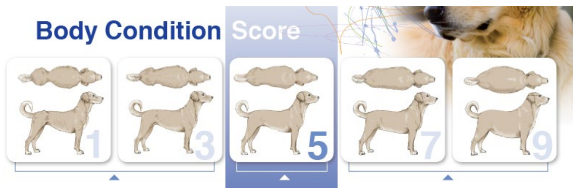
Figure 1. The WSAVA body condition score for dogs (WSAVA, 2013).

Cats with a low or high body condition score are more likely to develop health conditions, and are at greater risk of mortality, compared to those with a healthy score (Teng et al., 2018a, 2018b). In dogs, high body scores are associated with poor thermoregulation, which may be dangerous during transportation (Davis et al., 2017), and low body scores are associated with higher rates of mortality, and increased vulnerability to stressors (Banzato et al., 2019).