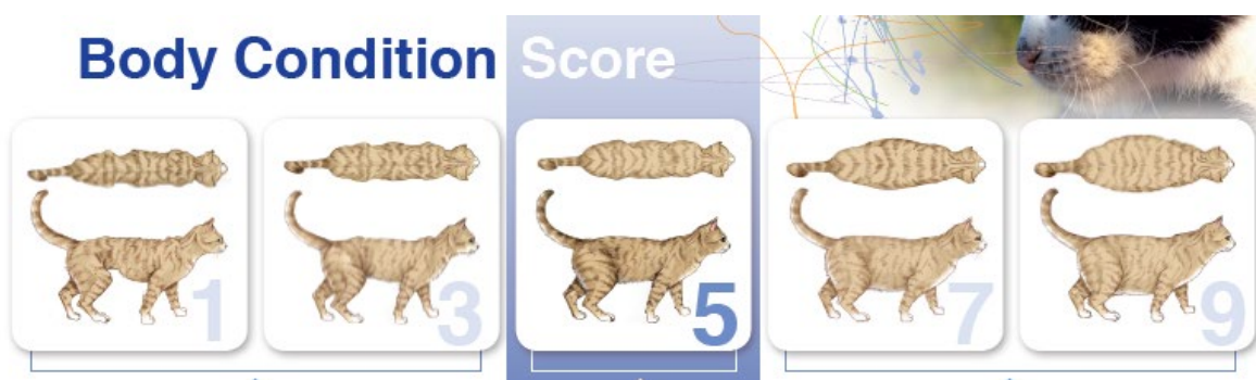
Figure 2. The WSAVA body condition score for cats (WSAVA, 2013).