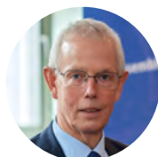
Tiny Kox President of the Parliamentary Assembly of the Council of Europe

“The Council of Europe has a wide range of tools that our member states can trigger to ensure and implement the best electoral standards and practices, ranging from the European Convention of Human Rights to the invaluable standards and guidelines established by the Venice Commission or the Budapest Convention on Cybercrime. Our national parliaments bear an important responsibility in providing legal frameworks compatible with our core values and overseeing, their implementation. May I again underline, on the eve of the Reykjavik Summit, the role of the Committee of Ministers in checking whether member states live up to their obligations to uphold democracy... I’m convinced that this conference will be another milestone on the road to reactivate our future activities in the field of elections.”