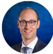
Martin Candinas President of the Swiss National Council

“Free and fair elections are an indispensable means for citizens to express their opinions and to be able to make decisions. Crises, disasters and wars raise challenges for organisers of elections to which there are sometimes no clear answers. Innovations, especially of a technological nature, promise answers, and they promise new, more representative forms of voting”.